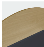
Natural Oak Laminated Head and Footboards