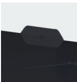
Enclosed Mattress Supports