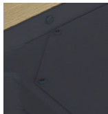
Anti Tapper Screws